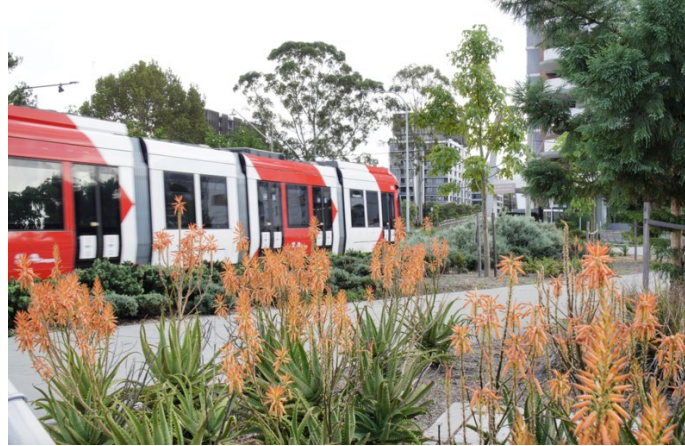
Above: Parramatta Light Rail (Stage 1) by Transport for NSW, Context and COX

According to the Jury, the impact of this project is significant. “From the iconic green track, to the planting of over 5,000 new trees, the project sets a new benchmark for climate-responsive infrastructure.”